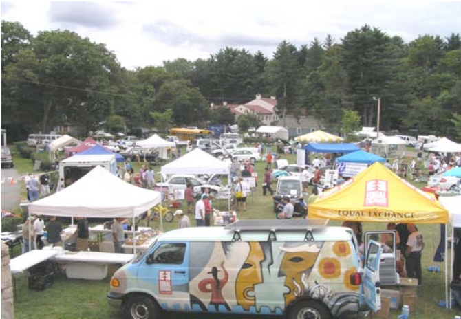
AltWheels @Larz Anderson Museum of Transportation