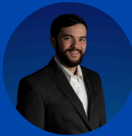
Cameron Kasper Energy Solutions Hyster-Yale Materials Handling