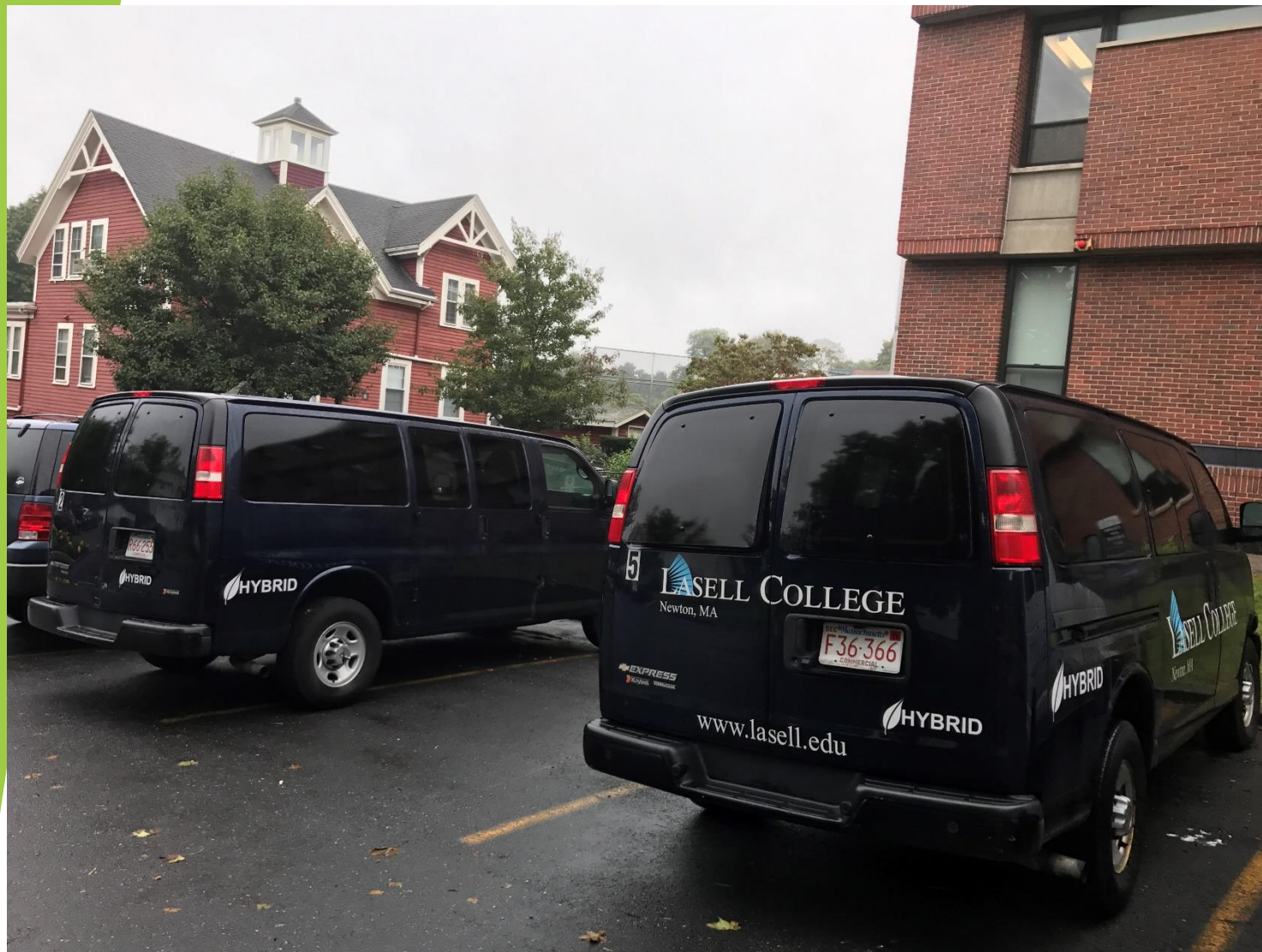
3 Chevrolet 2500 Passenger Vans