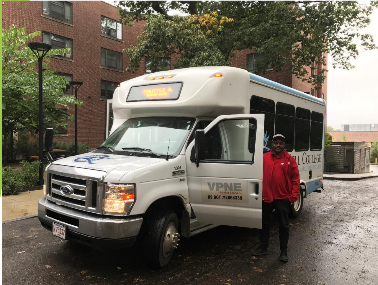
2 Ford Shuttles